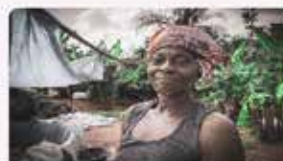
Postpartum Haemorrhage in Humanitarian And Rural Settings, The Extra Barriers Mothers Face By: The PPH Foundation Mothers living in humanitarian and rural settings face...