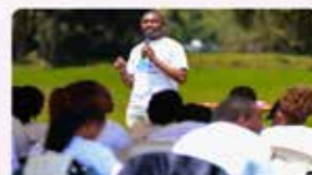
Building Awareness And Advocacy For Postpartum Hemorrhage, How Community Engagement Saves Mothers' Lives By: The PPH Foundation Postpartum haemorrhage remains one of the leading causes of maternal death...